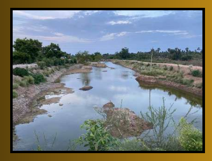
Since 1993, March 22 has been celebrated as World Water Day. As a result, millions of people in the world are starving for water every year. In view of future SKCRF taken many initiatives in recent years. The tanks we created in Kuttapalayam and Valliyarachal villages in Kangayam taluk of Tiruppur district are now full.