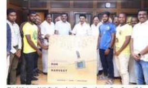
Chief Minister M.K. Stalin releasing Thunderous Run, Bountiful Harvest in Chennai on Monday. SPECIAL ARRANGEMENT